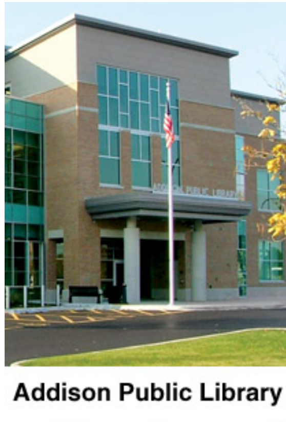
Addison Public Library

The mission of the Addison Public Library is to provide informational, cultural, educational and recreational resources and services to the citizens of Addison. The Addison Public Library seeks to accomplish its mission through prudent management and development of its resources and by providing access to a broad range of materials and services to meet the present and future needs of the community it serves. In this effort the Addison Public Library cooperates with other libraries and educational, cultural, community and governmental agencies and institutions.