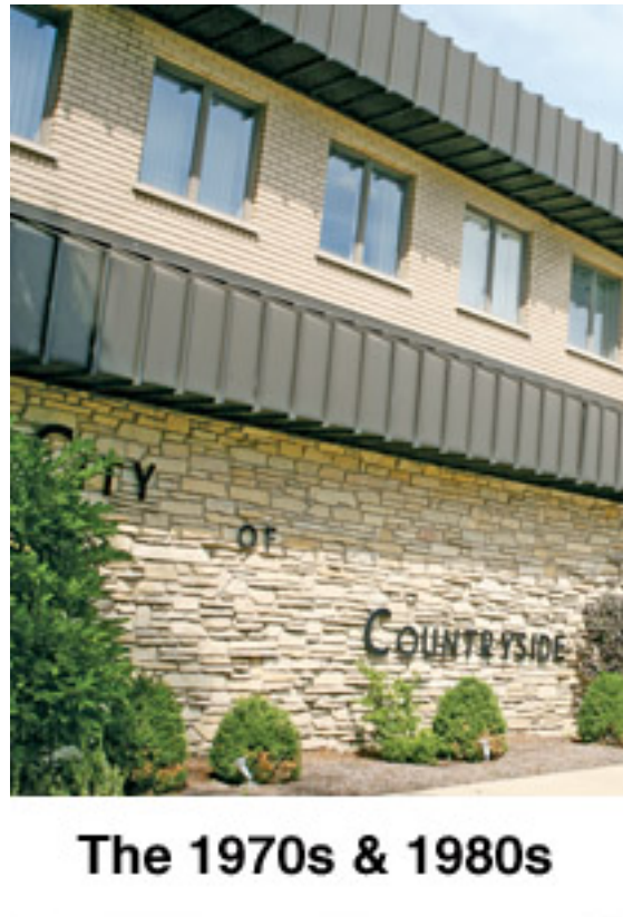
The 1970s & 1980s

As Countryside continued to expand population-wise, it was simultaneously growing in land size during the 1970s and 1980s. In 1971, the City annexed an area located south of Joliet Road, and by the 1980s, Countryside stretched over four square miles. This addition sparked further development in the community, leading to a surge of growth in the retail and industrial sectors.